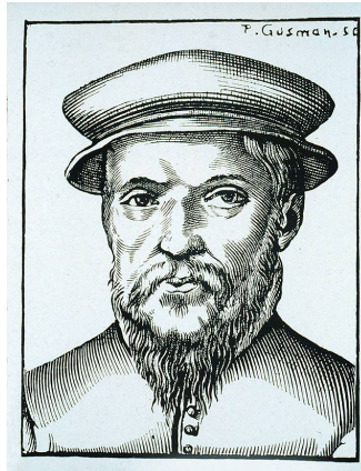
Figure 1: Claude Garamont, an icon of font design. World-renowned for his elegant typefaces, which inspired many generations of typographers.

G OOD golly, nobody wishes for a pedestrian theme! Let your entourage know that you're rocking an editor fit for a king with this finely crafted 'wealthy' theme. Selecting it shall enable the following fancitudes: